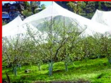
ANTI HAIL NET

Book Your Order in advance to Avail Discounts.