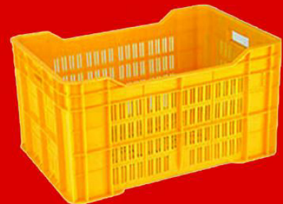
MULTI PURPOSE FRUIT CRATE

Book Your Order in advance to Avail Discounts.